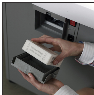
The DAHLE CleanTEC® filter traps up to 98% of the fine dust and provides a healthier work environment.