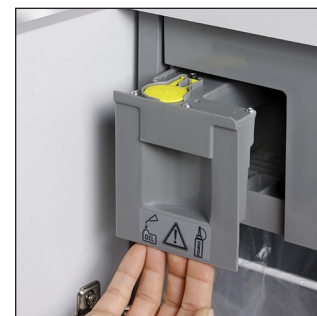
The EvenFlow Lubricator automatic oiler provides slow, continuous lubrication & ensures peak performance.