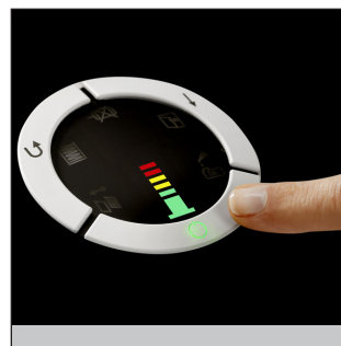
The easy-to-use command dial controls all of the shredder's functions and illuminates the proximity to sheet capacity.