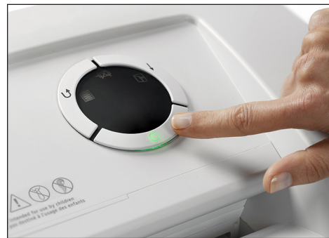
The easy-to-use command dial controls all shredder functions including power up, reverse, and continuous run.