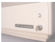
Lock and Key Feature