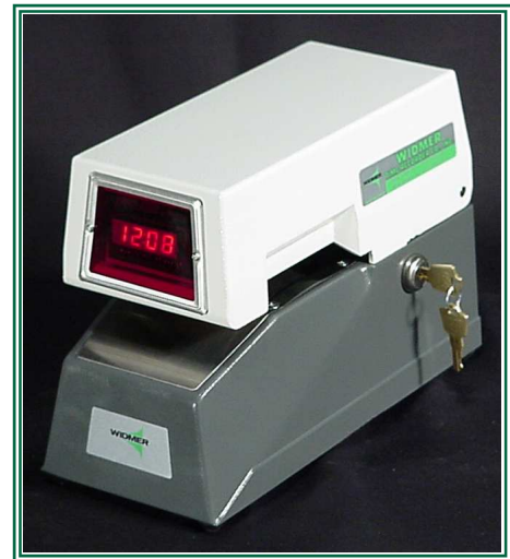
Mfg. Hackensack, NJ , USA Model T-3 available without digital display

Six Sided Word Cylinder Military Time Reverse Print Fractional Minute Adjustable Trigger Removable Die Plates Master Clock Control Feather Touch Trigger