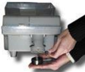
Unscrew knob relasing metal ring.