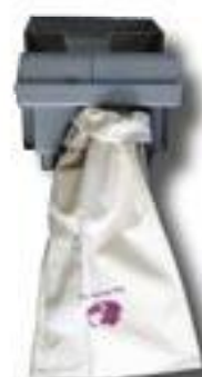
Bring ring back down and replace knob, then fold bag top down to cover metal ring