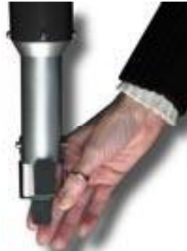
Attach coin wrap- per stopper. Hooks on (Shotgun style wrapper work best)