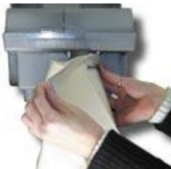
Pull bag up around metal ring