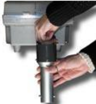
Attach coin tube holder