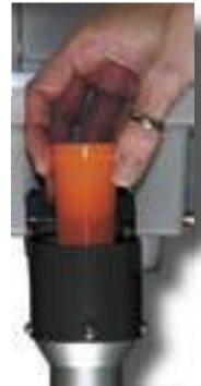
Drop coin direc- tor down into tube holder. This directs coins into wrappers.