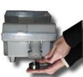
Unscrew knob relasing metal ring.